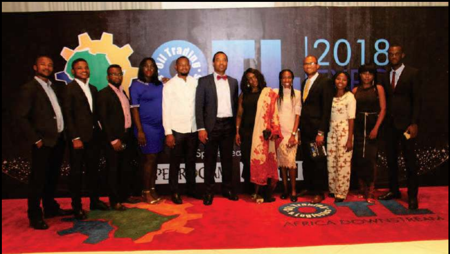
Team OTL Africa